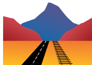
The Flinders Ranges Council