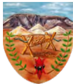
District Council of Coober Pedy